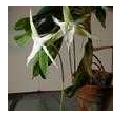
Angrecum sesquipidale Darwin's orchid is a consistent Christmas bloomer.