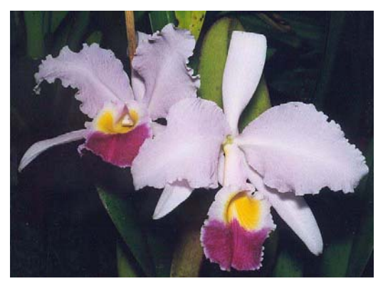
Cattleya trianae , native to Colombia and found in many named varieties.

Cattleya trianae is endangered in its native habitat as a result of environmental degradation and urbanization.