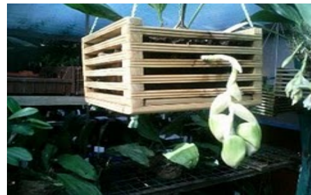
Flower spike through the bottom and sides of the planter