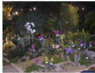
R.F. Orchids display at 18WOC