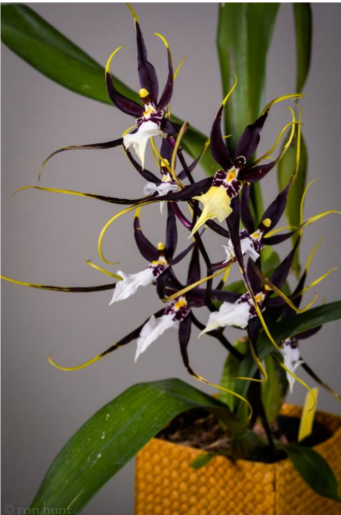
Mtssa. Kauai's Choice 'Tropical Fragrance' AM/AOS Javier Morejon