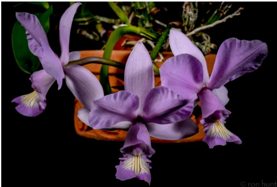
C. nobilior v. amaliae coerulea