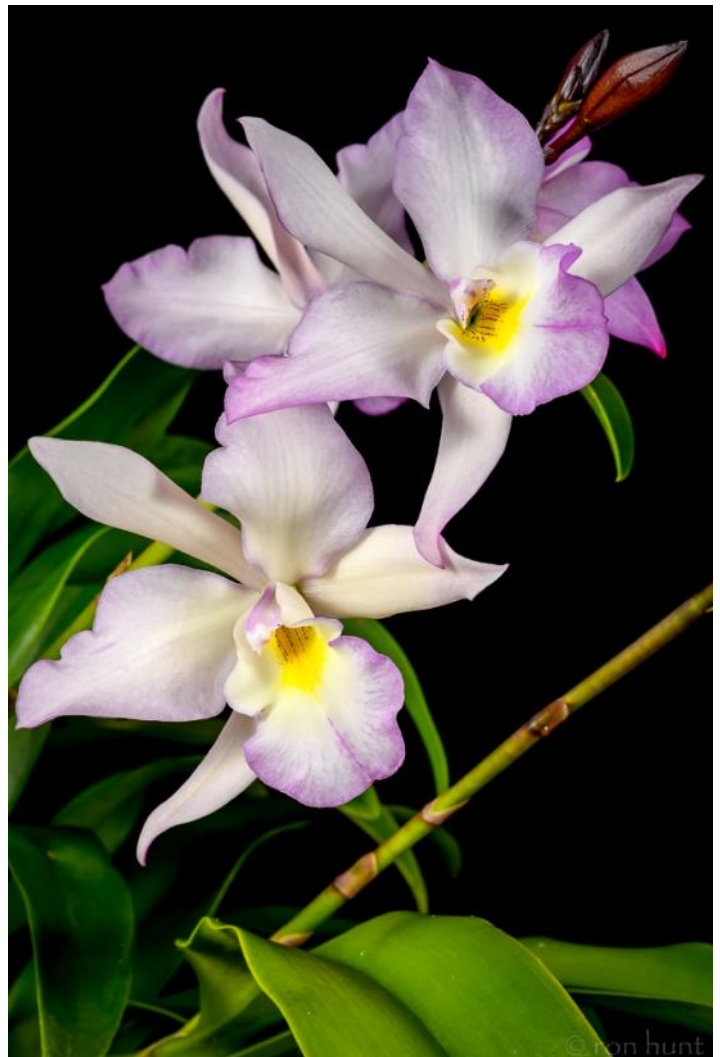
Iwanagara Apple Blossom - Christa Collins