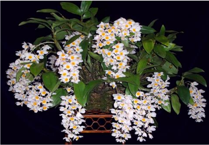
'Den. Farmeri Paraiso Tropical', CCM 85pts.

Hello all: Just last night we had a major thunderstorm go through parts of greater Miami. The airport had to delay flights and reroute incoming airplanes. Some areas had a 4 to 6 inch accumulation of water.