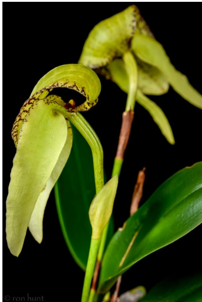
Bulb. arfakianum