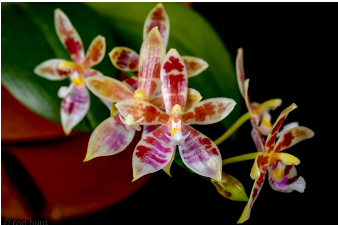
Phal. tetraspis 'Classic Moonbeam' - Ralph Hernandez