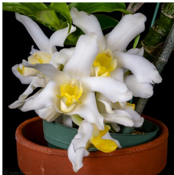
Chysis bractescens