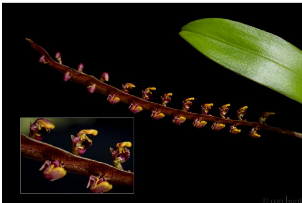
Bulb. falcatum