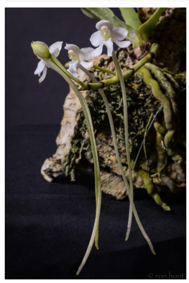
Aerangis somalensis