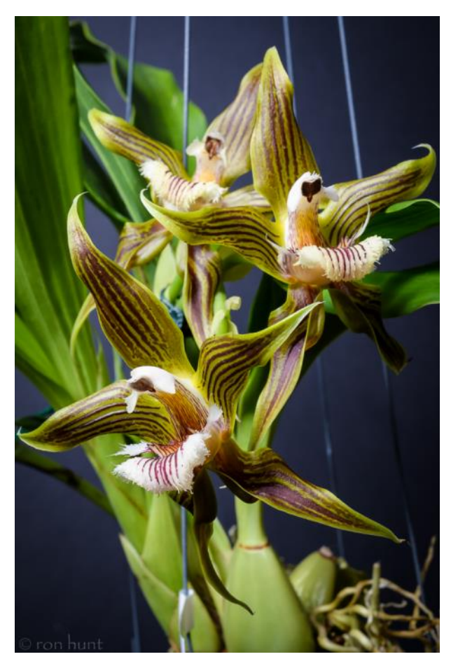
Galeottia grandiflora—Alfredo Figueroa and Angel Lamboglia