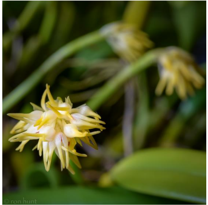
Bulbophyllum odoratissimum