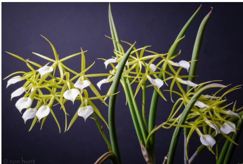
Brassavola cordata