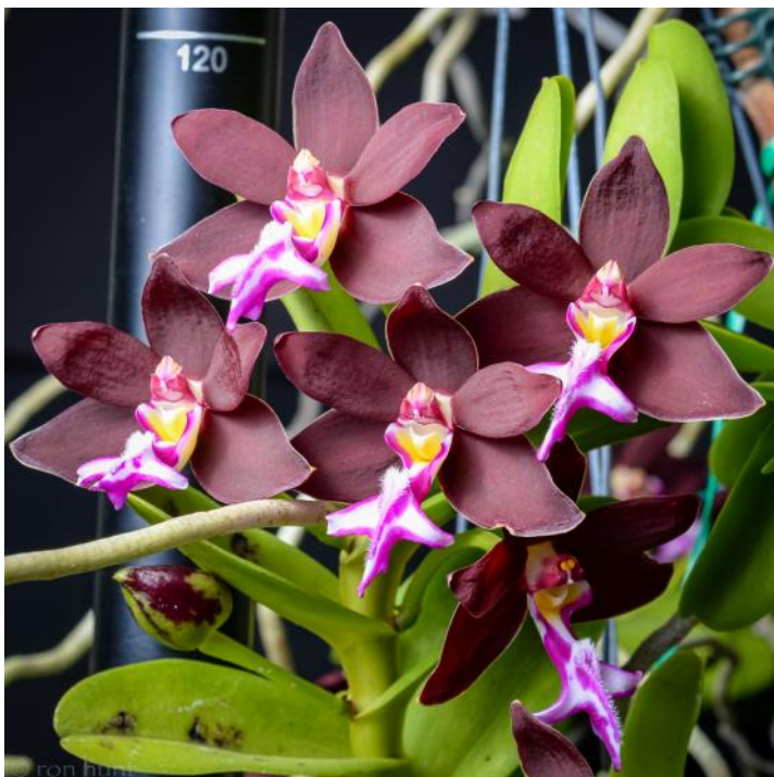
Trichoglottis brachiata