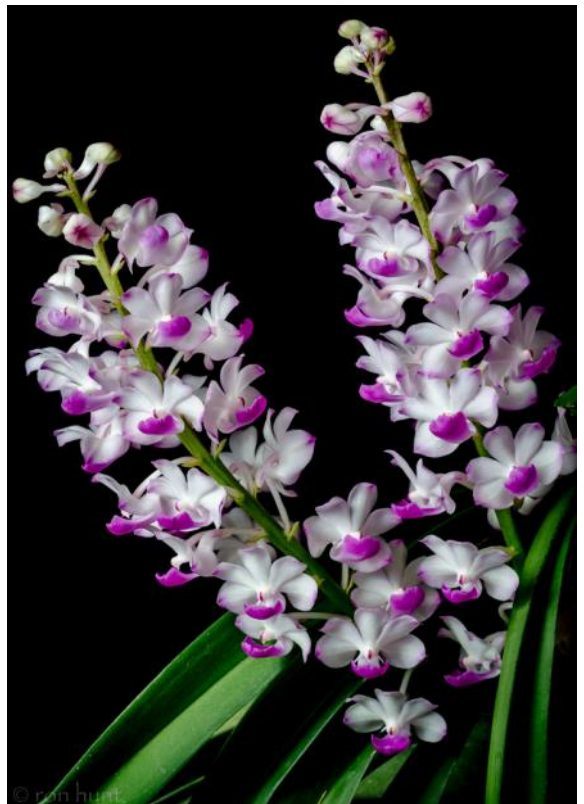
Rhy. celestis pink - Betty Eber