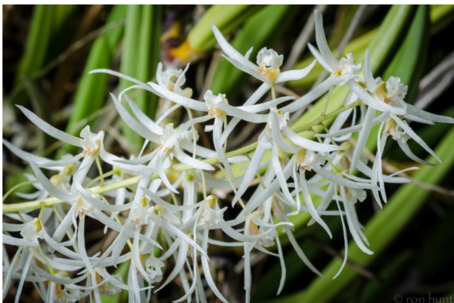
Den. wassellii