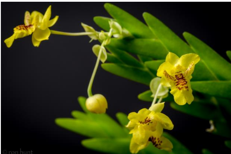
Lockhartia dipleura - Betty Eber