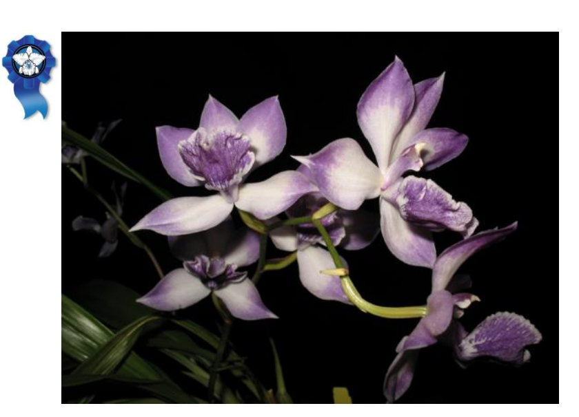
Zygonisia Cynosure "Blue Birds"—Christa Collins