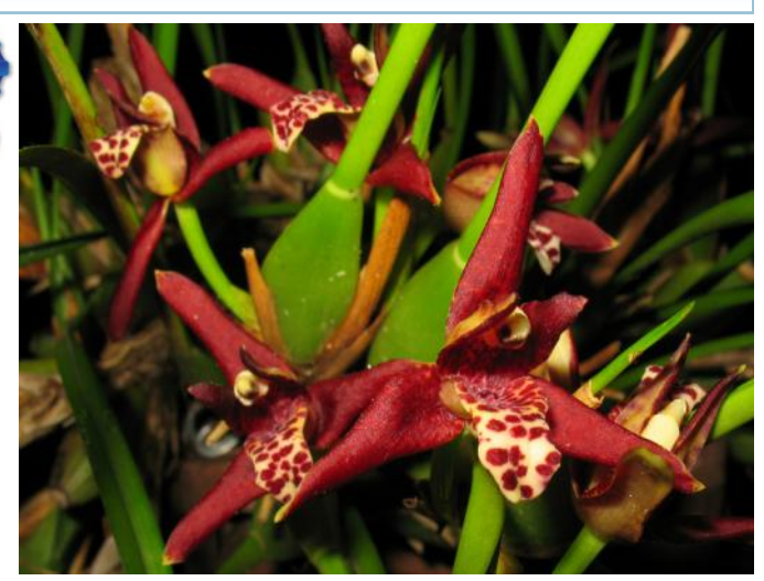
Max. tenuifolia—Javier Morejon