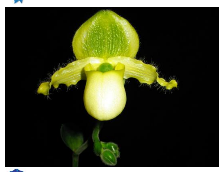
Paph. primulinum f. flavum--Pedro Boneti