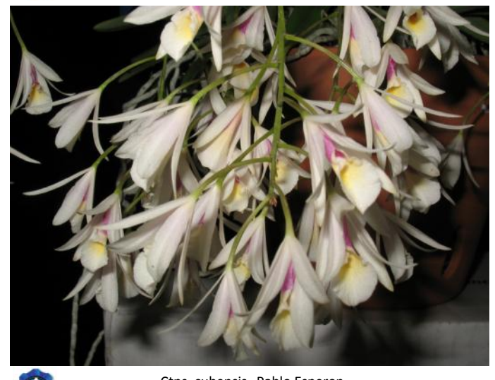
Ctps. cubensis--Pablo Esperon