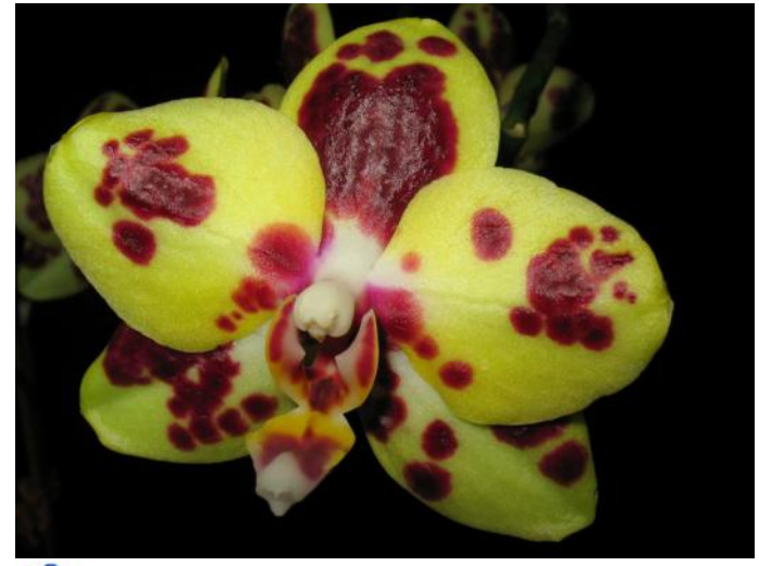
Phal. Sogo Pearl 'Pro'--Ann Thayer