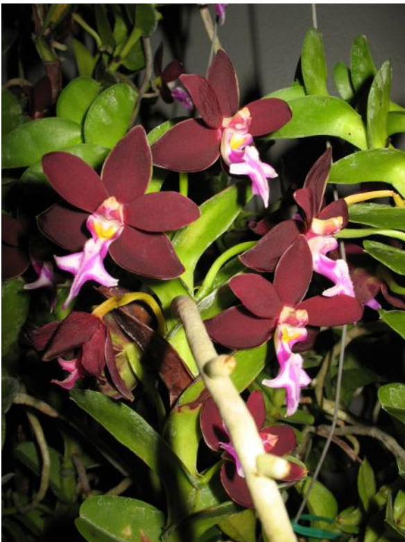
Trgl. brachiata var. philippinensis