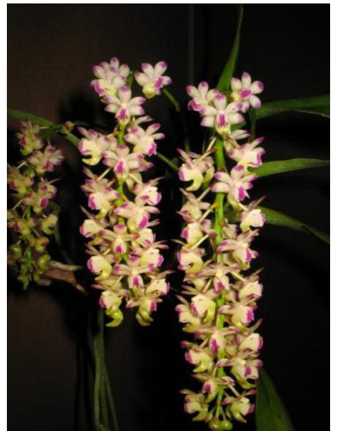
Aer. quinquevulnera