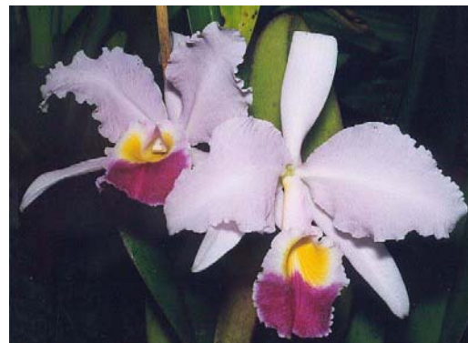
Cattleya trianae , native to Colombia and found in many named varieties.

Cattleya trianae is endangered in its native habitat as a result of environmental degradation and urbanization.