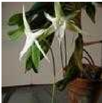
Angrecum sesquipedale Darwin's orchid is a consistent Christmas bloomer.