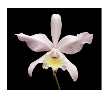
An Orchid author unknown

These are exciting times and more changes are on the horizon for our AOS. www.aos.org